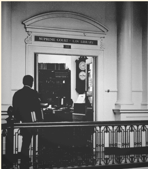
Year unknown: Law Library in its 2 nd floor location